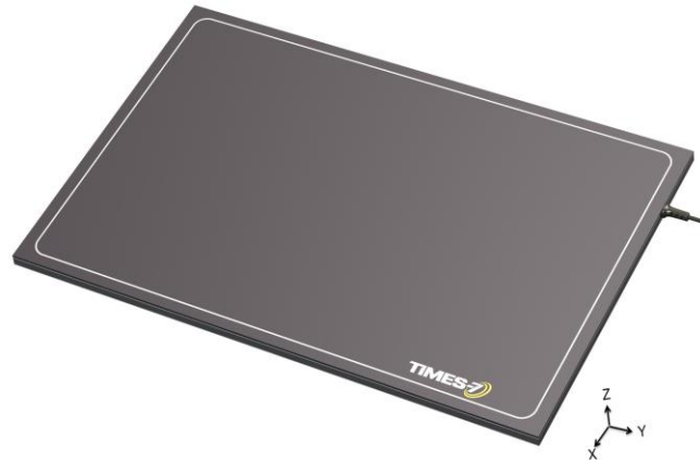
The SlimLine A7060

Proven in a diverse & growing range of markets, applications include: retail & customer interaction, conference & people tracking, race timing, baggage handling, and logistic & supply chain asset management.